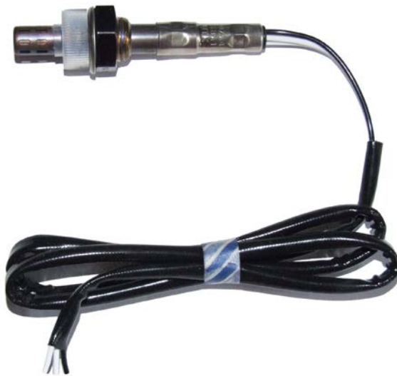
Lambda Sensor – LMBDA-01